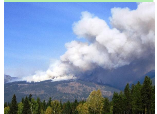
Wildfire Happens - Be Prepared

Improve Fire Fighter Safety and Effectiveness